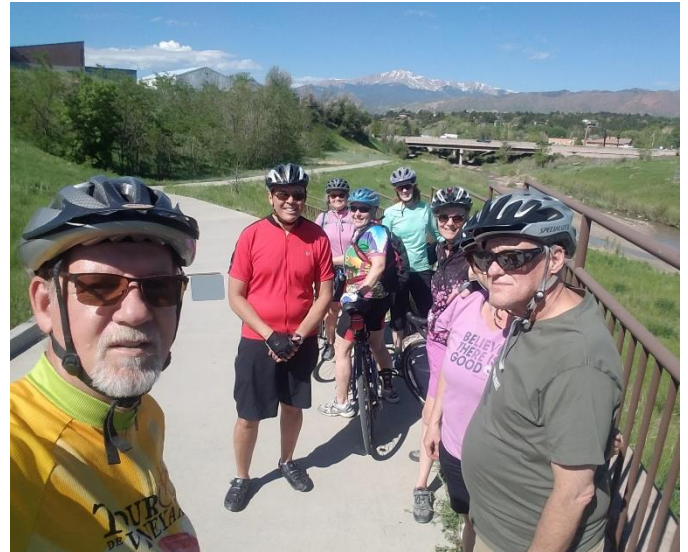
The Hbly Pedalers biking group have started riding again!