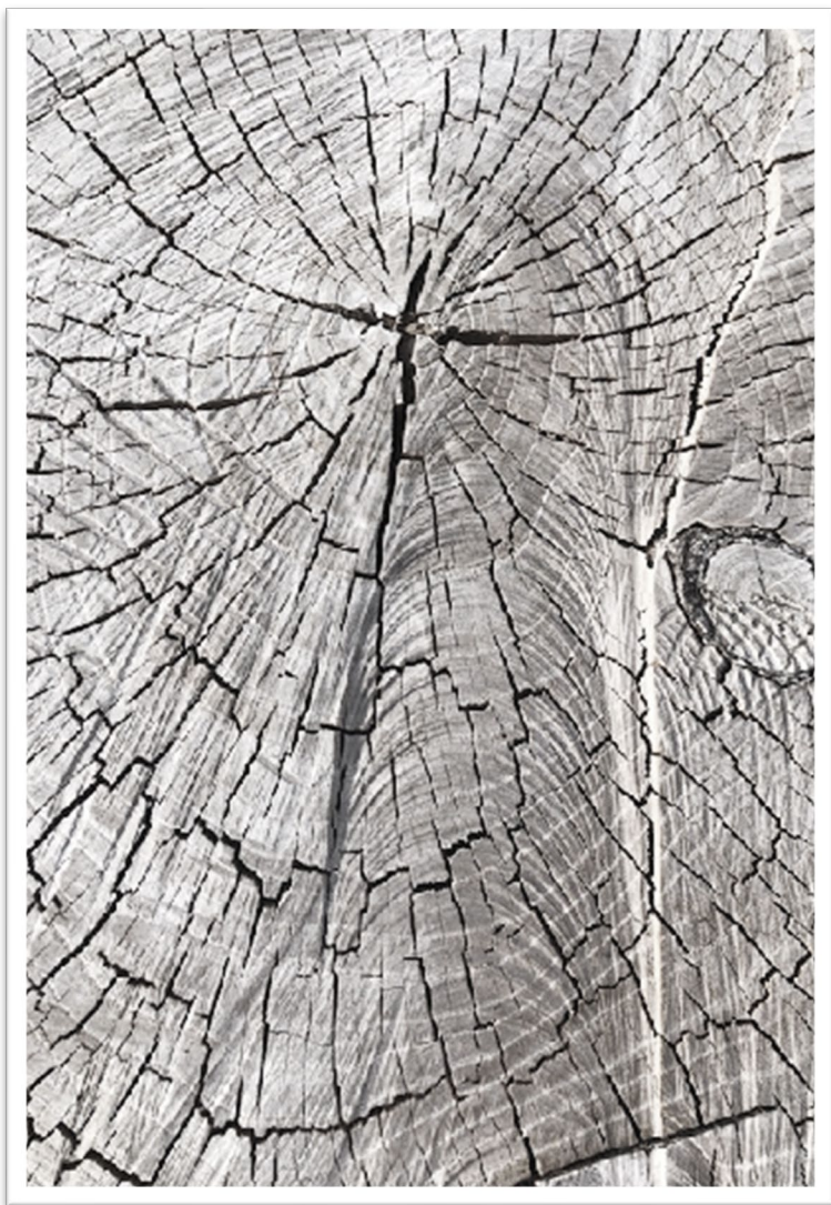
“In All Things”